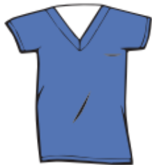
RN Galaxy Blue