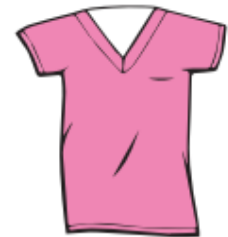
Mammography Shocking Pink