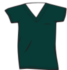
Inpatient Dietitian Hunter Green