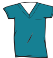
Rehab (PT/OT/SLP) Caribbean Blue