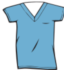
Procedural (Cath, IR, OR, LD) Hospital Provided Ceil Blue