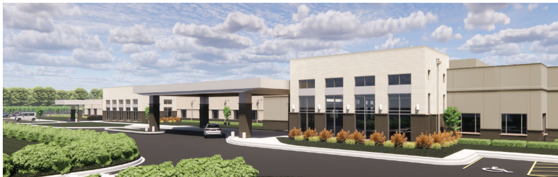
Jeffersontown inpatient rehabilitation hospital