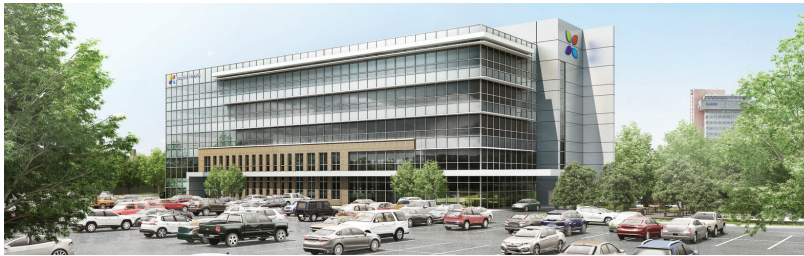
Breckenridge Lane outpatient facility